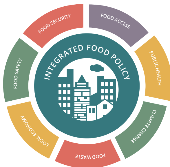
FIGURE 1 – MULTIPLE ENTRY POINTS FOR URBAN FOOD POLICY

Good practices in urban food policy are being documented and shared among cities through initiatives such as the 2015 Milan Urban Food Policy Pact, the C40 Food Systems Network, the EUROCI-TIES food working group, national inter-city networks, as well as a growing number of publications and conferences.