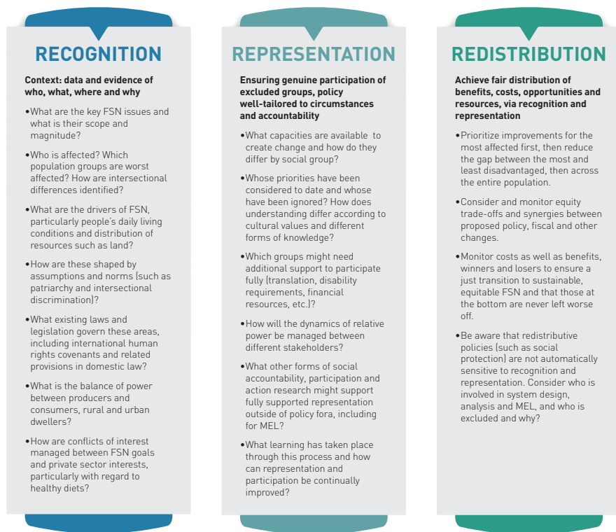
FIGURE 13 ROADMAP TO EQUITY-SENSITIVE POLICYMAKING

Notes: FSN: Food security and nutrition. MEL: Monitoring, evaluation and learning.